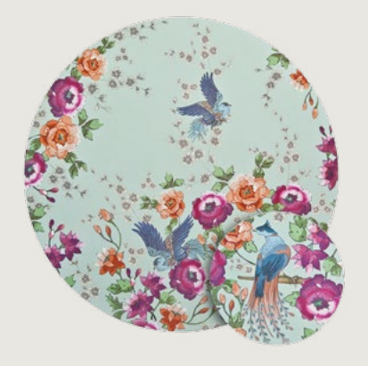
This set of four Monsoon Kyoto placemats and coasters from the collection decorates the table with elegance. The charming set is perfect for special occasions as well as everyday use.

Inspired by a painterley Oriental floral pattern taken from the panel of a Monsoon dress, this beautiful collection features a watercolour palette on fine, soft cream china.