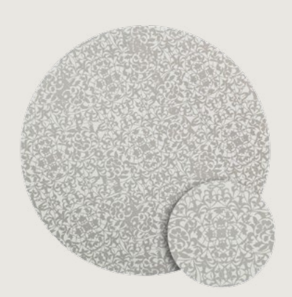
The Filigree Silver placemats and coasters from Denby Monsoon Home Collection are a perfect addition to the dinner table with chic patterning and a wipe clean surface means this set is equally stylish and practical.